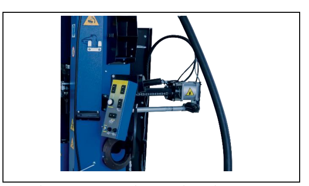
Tyre-changer-G1250.30_Electromechanical actuator_Memory button-DI-3