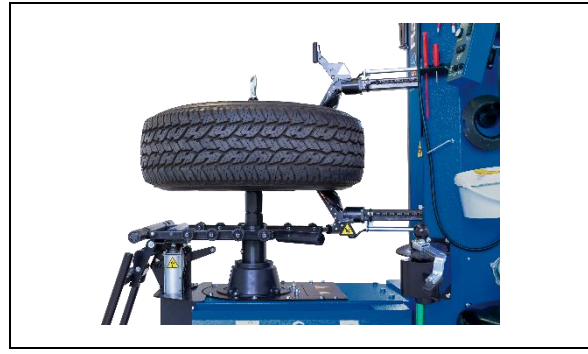
Tyre-changer-G1250.30_Double bead breaking-DI-2